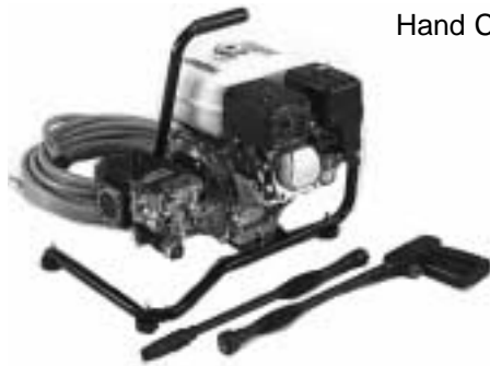
Hand Carry Gas