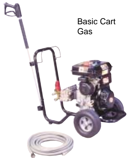
Basic Cart Gas